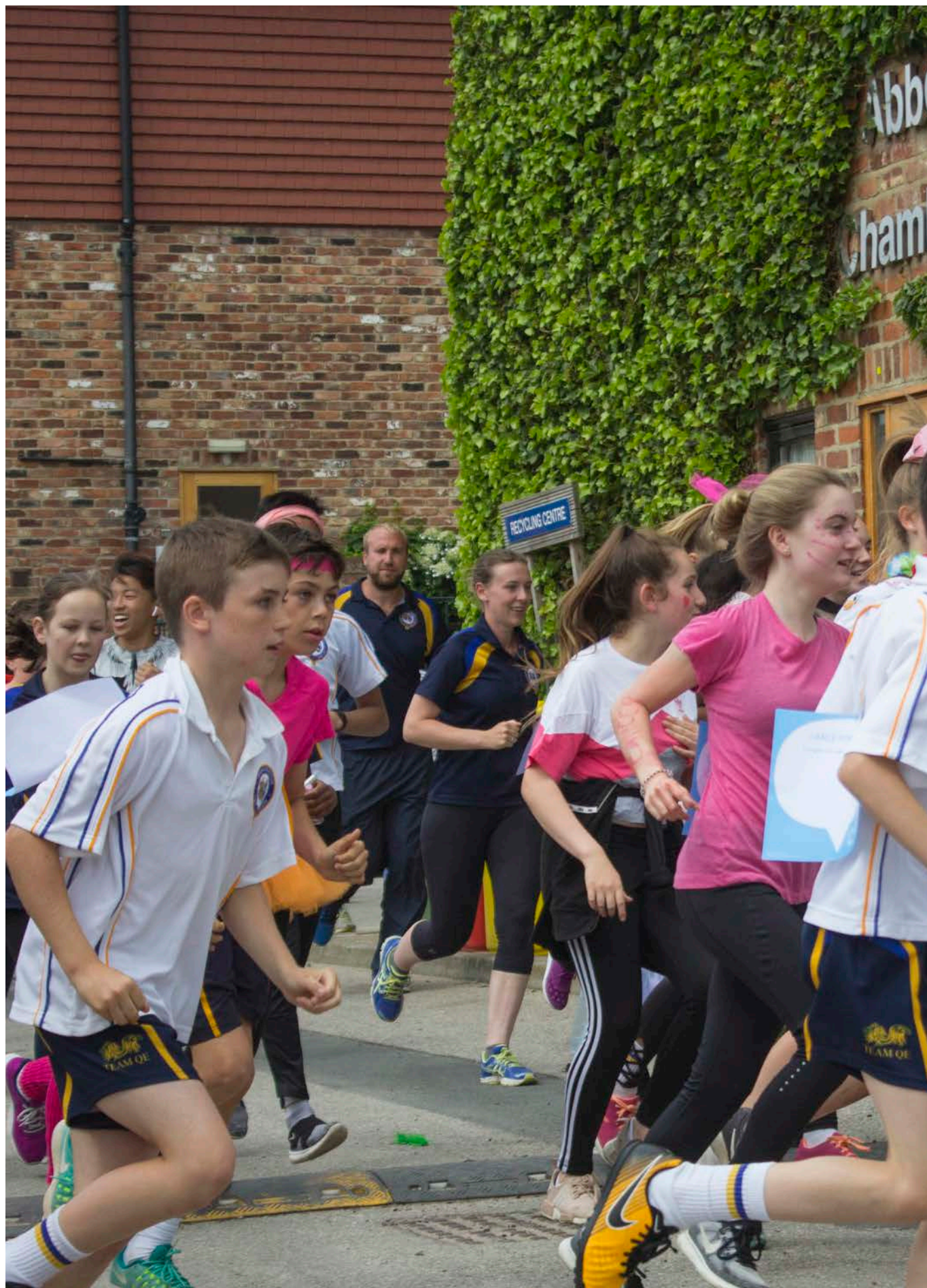
King's Magna students and staff taking part in the Race For Life