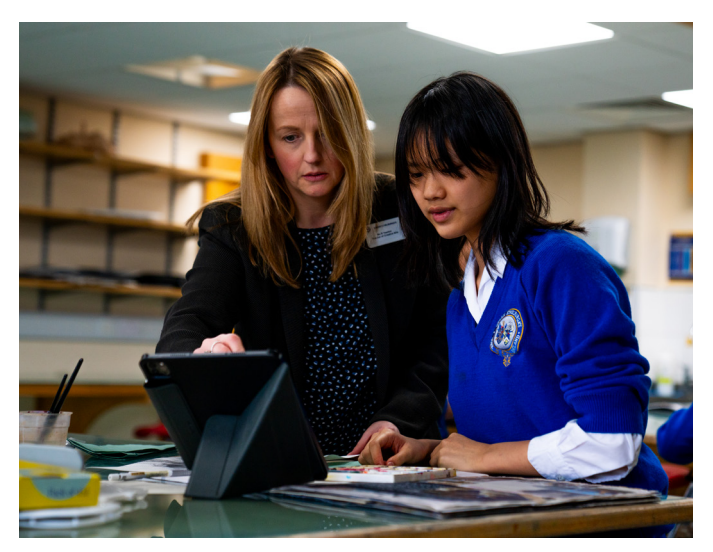
looking at iconic designs, styles and movements that inspire the ever-changing world of fashion.

Student will develop the knowledge, understanding and skills to realise personal intentions relevant to graphic communication learning not only practical techniques and ideas but also developing knowledge and the opportunities available in the graphics industry. The course allows students to grow in confidence in a creative environment enjoying and engaging in research into past and present fashion and textile designers and